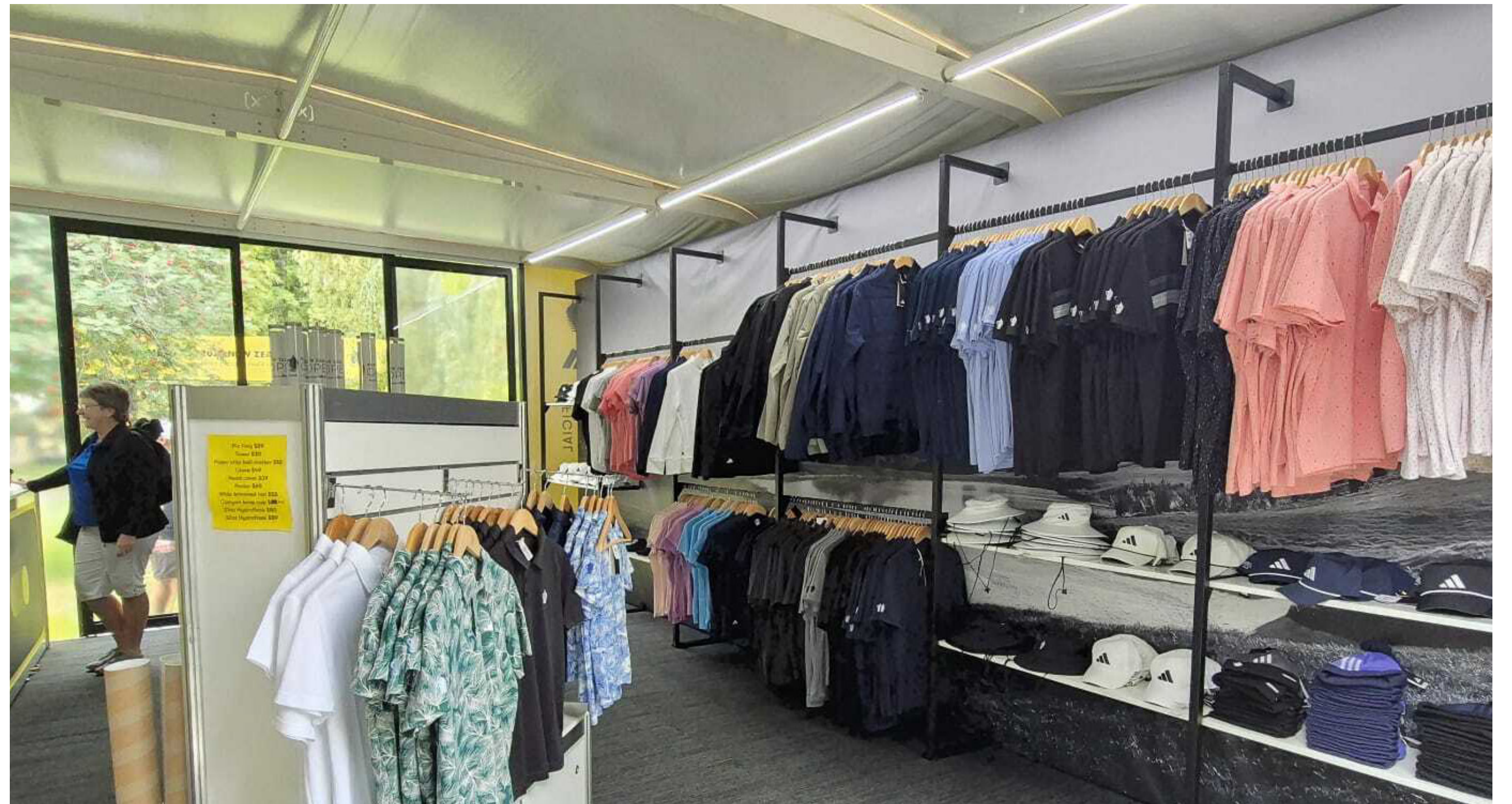
AirClad X New Zealand

Transform store openings or product launches with a premium, design-led pop-up shop. AirClad X structures deliver a clean, memorable retail experience, tailored to maximise customer engagement and brand visibility.