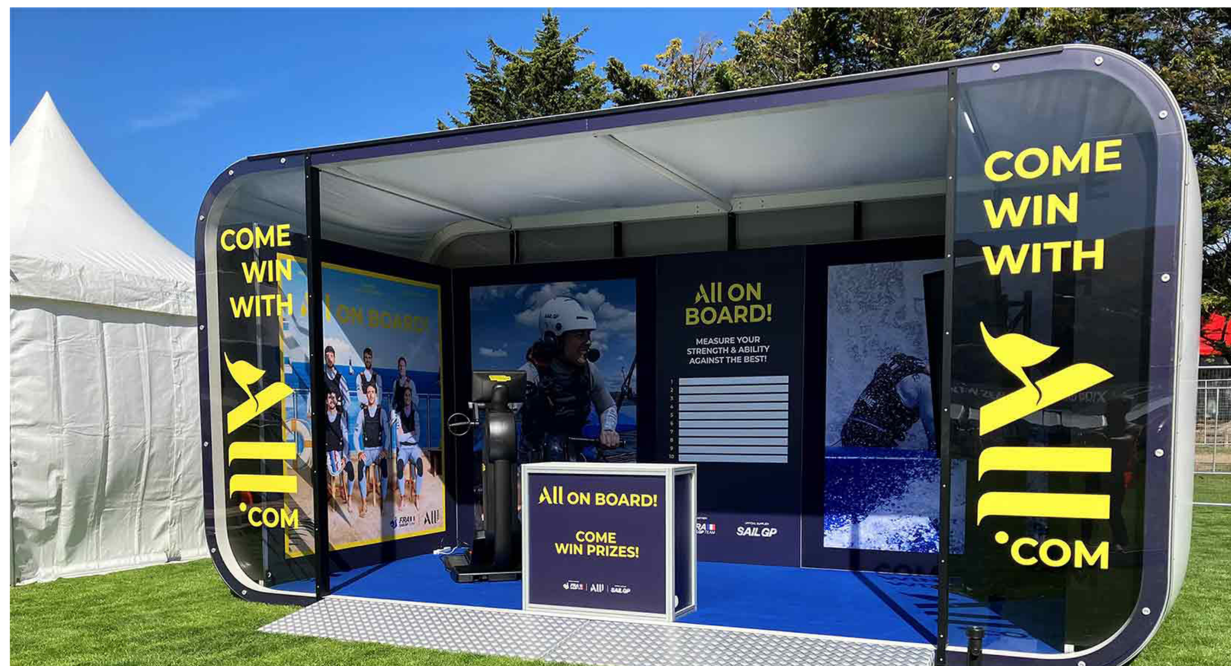
AirClad X New Zealand

From product showcases to mobile meeting spaces, the versatility of AirClad X meets every corporate need. Give your events a sophisticated edge with adaptable, branded structures that leave a lasting impression.