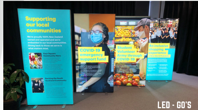
LED - GO'S