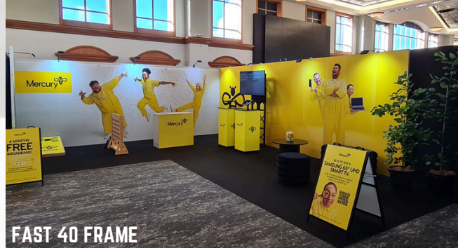
FAST 40 FRAME