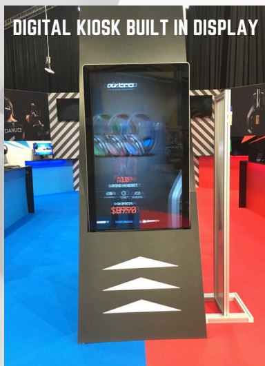
DIGITAL KIOSK BUILT IN DISPLAY